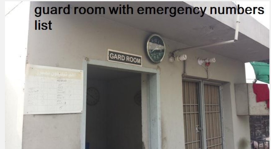
guard room with emergency numbers list