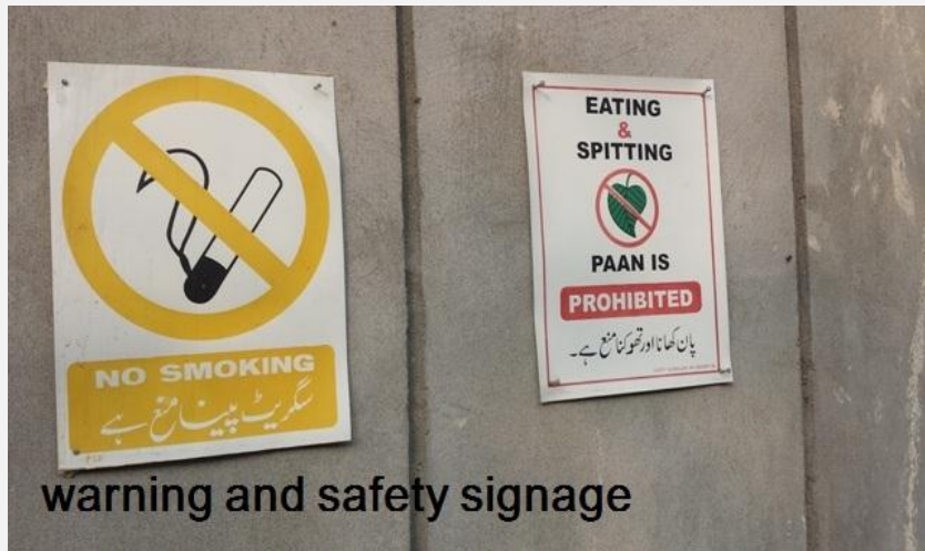
warning and safety signage